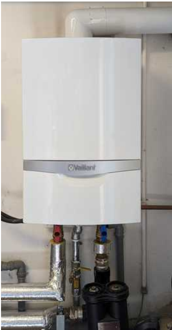
60 kW replacement boiler installed in child care building at 134 Stewartstown Road – September 2021

Cleaning solar panels significantly improves their efficiency.